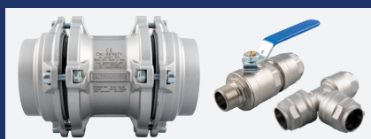
AIR PIPE FITTINGS